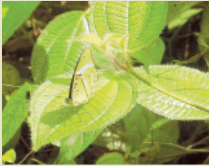
A nymphalid butterfly rests on Bellucia , a common plant species in secondary forests and produces fruits eaten by a range of large mammals, including tapir and brocket deer.