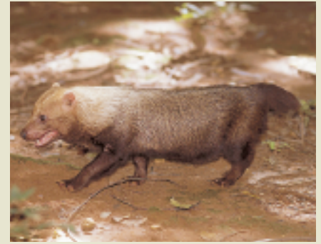
The elusive and incredibly rare bush dog.

Perhaps my main finding was that many species of conservation importance do not live in these regenerating second-growth forests. I never saw South America's largest primate, the black spider monkey, outside Jari's primary forest. These noisy charismatic monkeys are fussy about which fruits they eat. And because they weigh about 11kg, they can't